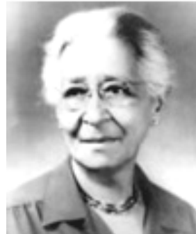
PTA's founders—Alice McLellan Birney (top left), Phoebe Apperson Hearst (top right), and Selena Sloan Butler (bottom)—led our nation into meaningful parent involvement in children's education.

Butler, were women of imagination and courage. They understood the power of individual action, worked beyond the accepted barriers of their day, and took action to literally change the world.